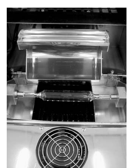
Accessibility to the optics is a critical feature of a UV-curing system.

Preventative maintenance on a UV-curing system is like sharpening your saw, it